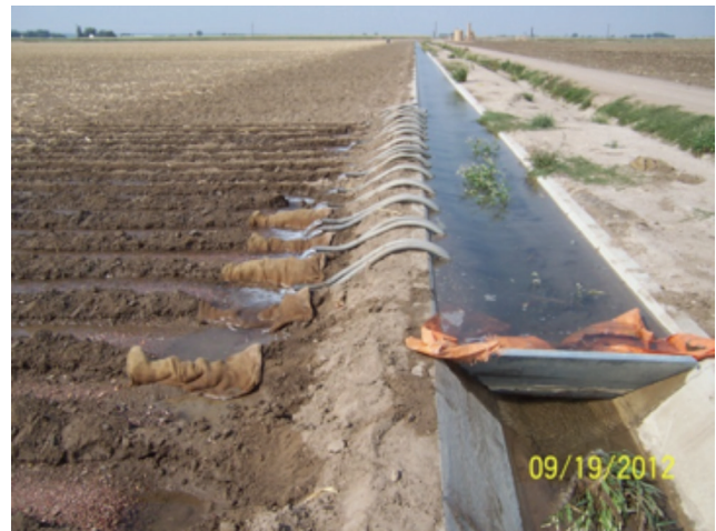
Figure 2. Furrow irrigation using siphon tubes, Northern Colorado.

In furrow irrigation, the soil surface is channeled and furrows are formed to direct the flow and avoid flooding the entire field (Figures 2 and 3). Water moves in these furrows and seeps through their walls and bottom. Each furrow receives an inflow of water, which could be provided by means of hand-