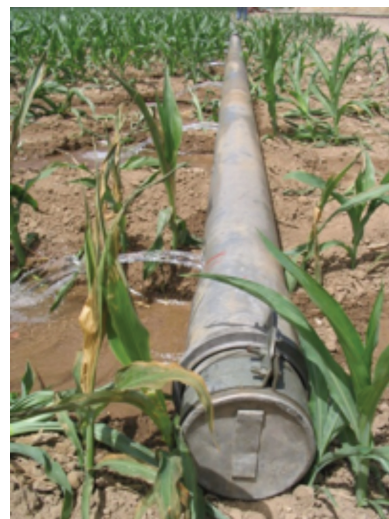
Figure 3. Furrow irrigation using gated pipes, Northern Colorado.