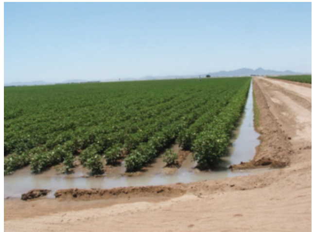
Figure 4. Furrow irrigation of cotton in Southern California.

Although improving irrigation efficiency has several benefits, it should be noted that the “lost” portion of water at one field is usually a source of water for another user somewhere downstream. As a result, increasing efficiency by reducing return flows (deep percolation and surface runoff) may negatively affect downstream users. That is why capturing surface runoff and reusing it at the same field is not allowed by the water law in several western States.